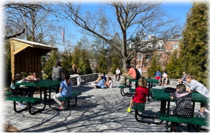
Mrs. Guarini's 3 rd grade classroom learning outside; on the tables, on the sitting wall and on the paver floor.

With the weather becoming more Spring-like, the outdoor classroom is being used more and more. I cannot thank the PTA, the MPPEF, and TLC Landscaping enough for all their help making this actually happen. The outdoor classroom makes outside learning so much more feasible as kids are not rolling around on the grass, or picking the grass, or rubbing their hands through the grass. We now have a nice structured area with sitting walls and paver paths. There is a whiteboard and internet access and amazingly, an aura of privacy from the amazing plantings that define the space. It really is something to be proud of.