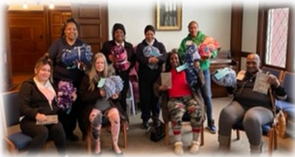
Here is a picture during a March 2022 ISP event in which the women were presented with the special blankets from our Highland students!