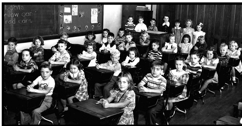
Highland School Classroom 1949-1950.

Old isn't always bad, especially when we take the time, energy, and resources to keep everything current. The Highland School should be celebrated for withstanding 9 decades of change. It's had a lot of help from the community, BOE, parent foundations, staff, administration, tech teams, and maintenance crews, but in the end we have a pretty good place for learning that happens to have just enough character to make us realize we are all part of a little piece of history.